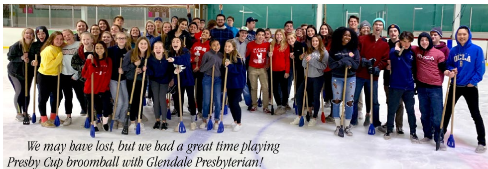
We may have lost, but we had a great time playing Presby Cup broomball with Glendale Presbyterian!

Finals Relief Puppy Party! Cost: Free Date: TBA- keep an eye out!