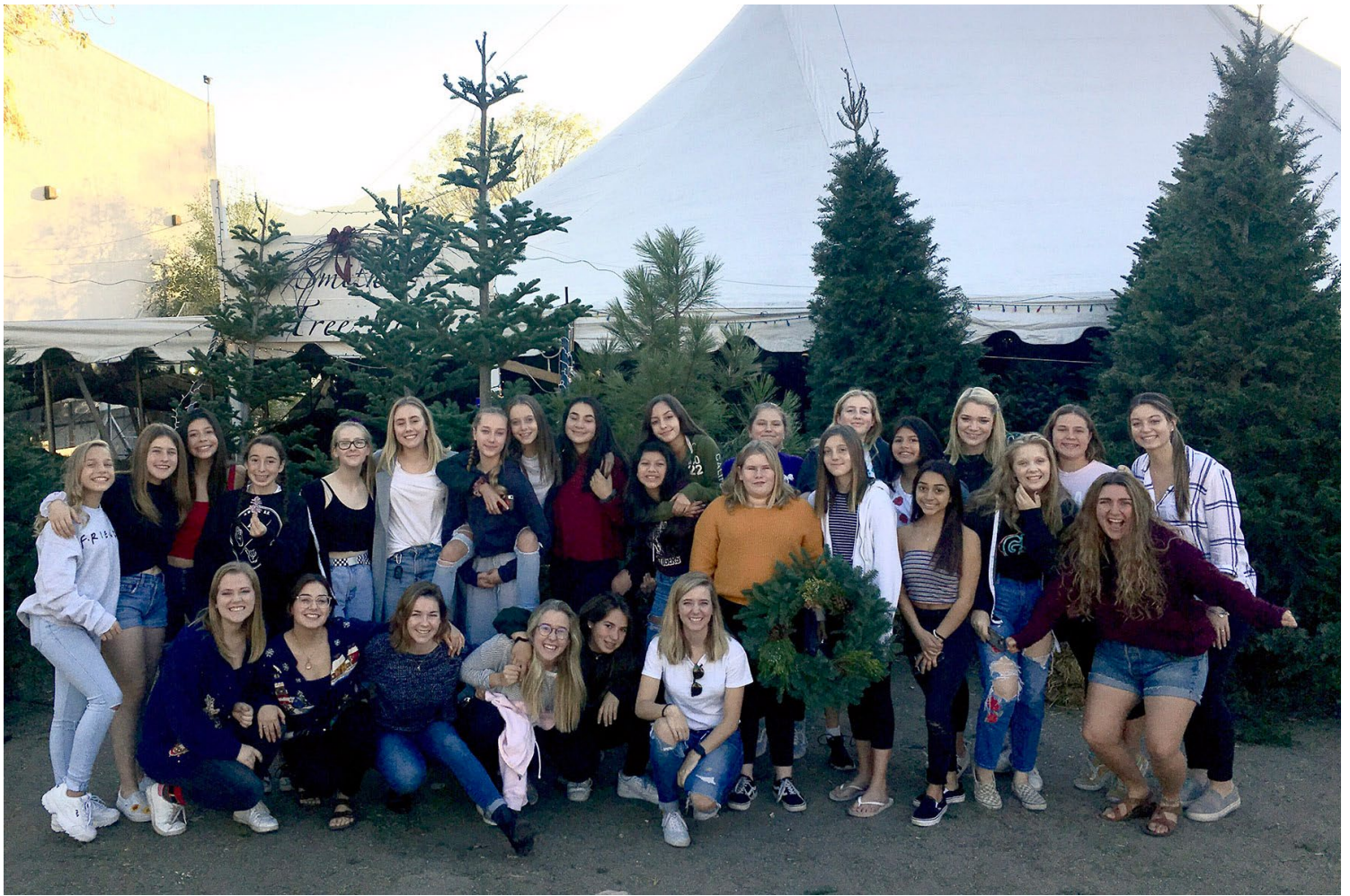
December 15th saw the Abide ladies celebrate Christmas with the “No Boys Allowed Christmas Extravaganza!”

I want to take this first Messenger of the year to pause and look back on the gifts of 2018, as well as to look forward to all God has in store for 2019.